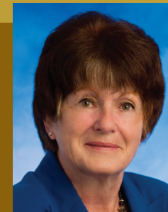
Vice Mayor Thelda Williams City of Phoenix