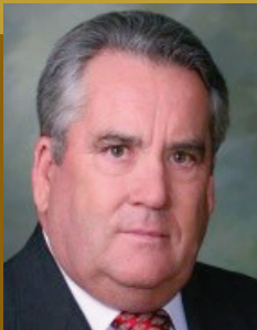
Mayor Gail Barney Town of Queen Creek