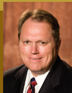
Mayor Scott Smith City of Mesa